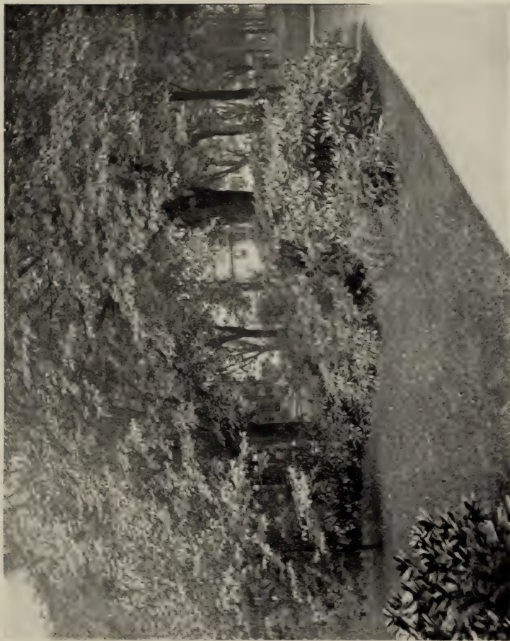
RHODODENDRON MAXIMUM WITH BERBERIS THUNBERGII.